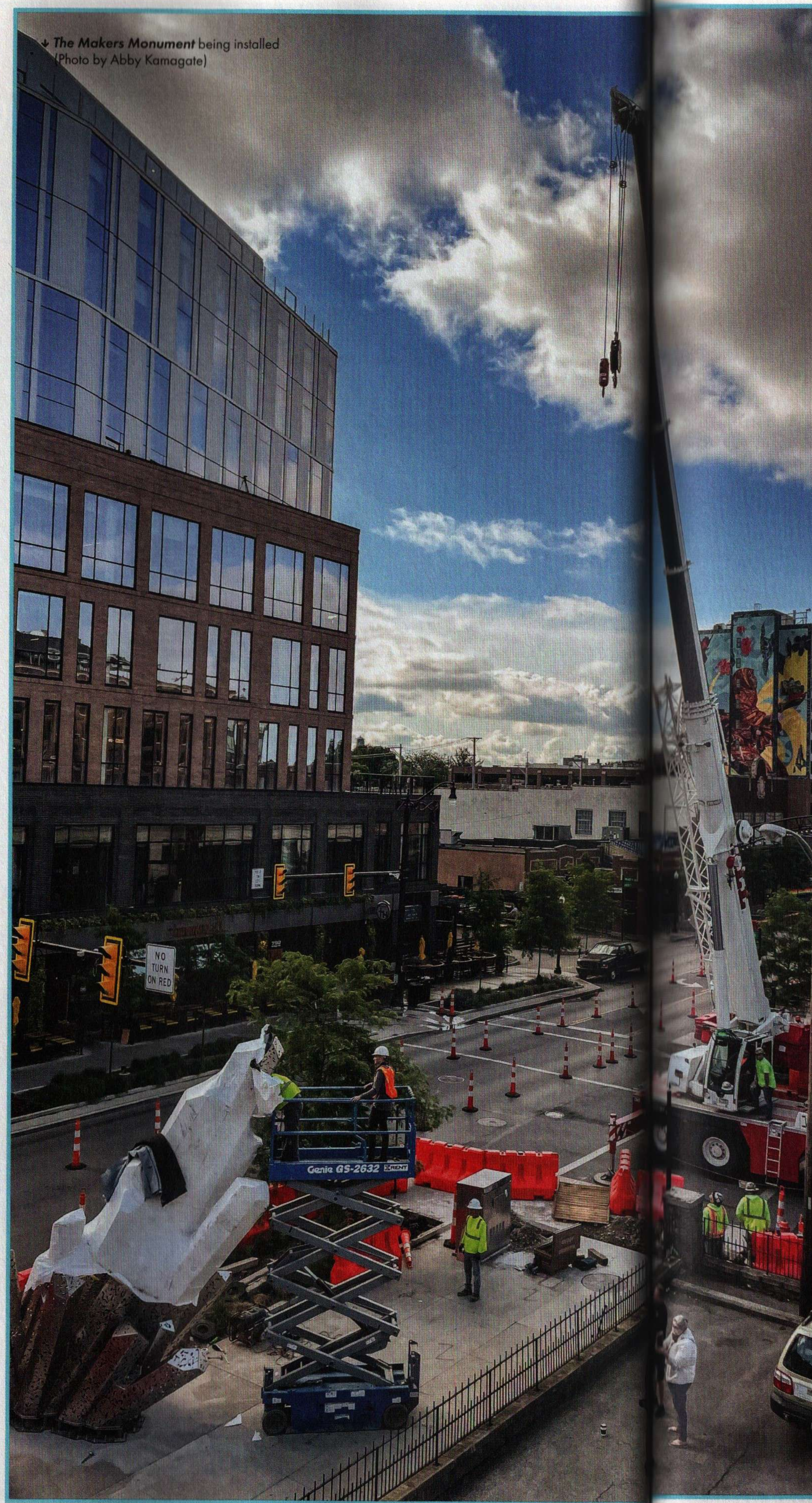
The Makers Monument being installed

WESTERVILLE 925 North State St, Westerville, OH DUBLIN 7143 Muirfield Dr, Dublin, OH