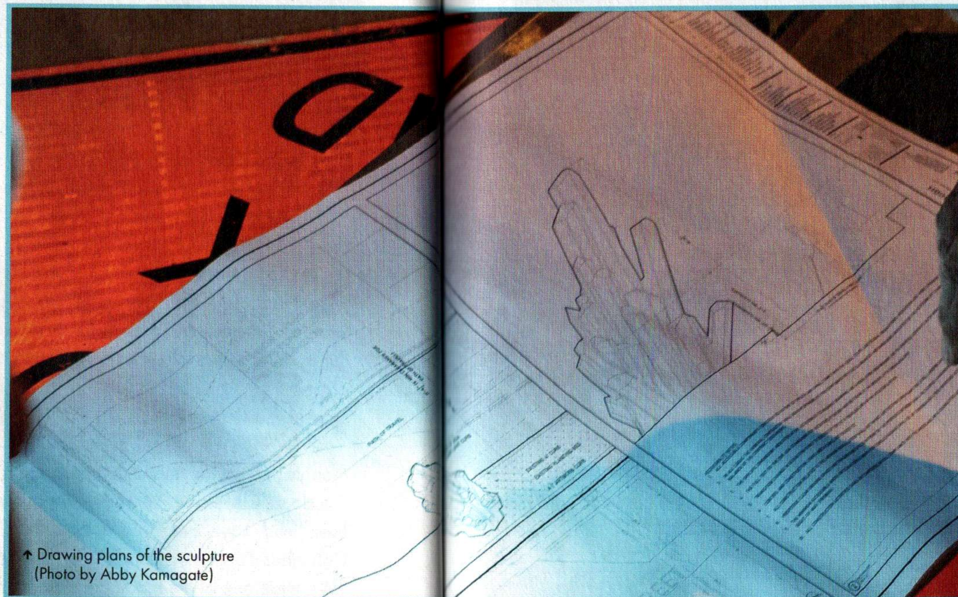
↑ Drawing plans of the sculpture

“From a distance, I wanted this explosive form that didn’t follow the vertical or horizontal lines of the streetscape,” he said. “But once you get closer and you see how light starts to pass through the cutouts and cast shadows, it really pulls you in. You see this curious pattern wrapping the entire work, and if you can take time to find one nugget, more will start to unfold.” →